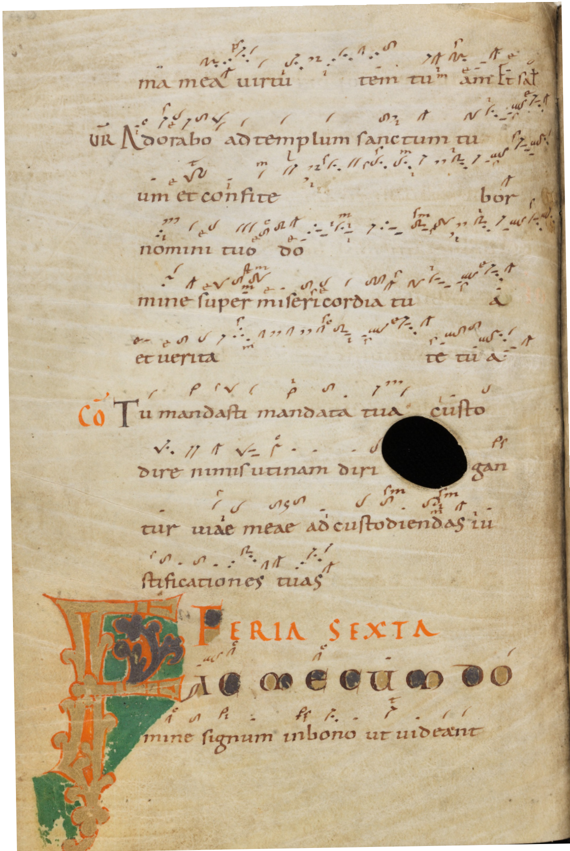
Engelberg, Stiftsbibliothek, Cod. 121 (1151), Graduale, Notkeri Sequentiae, c.960-970 A.D. www.e-codices.ch